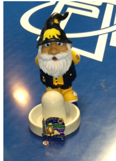
Berkeley Lions Wizard playing air-hockey at Albany Bowl during Emeryville Chamber mixer

Details are in the Google calendar—click on link above